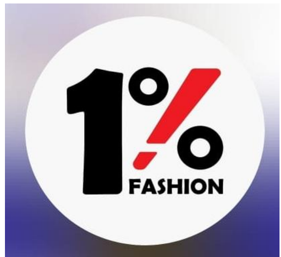
Company logo for One Percent Fashion