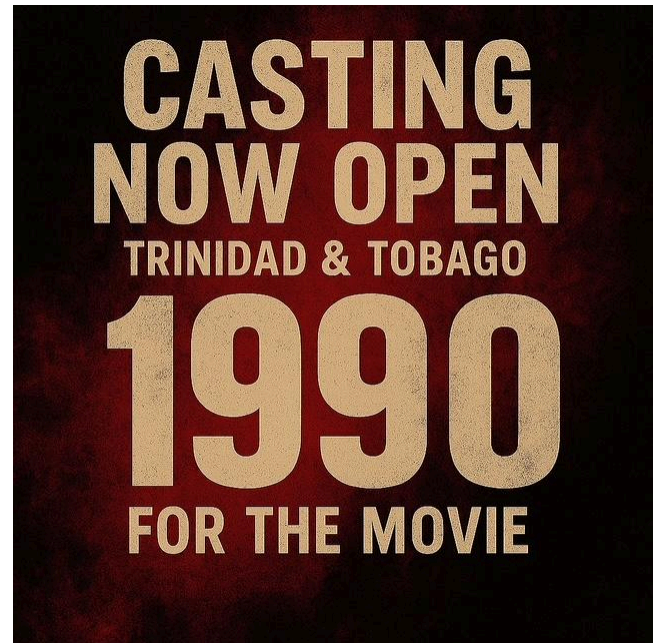
Poster for 1990 The Movie Casting Call